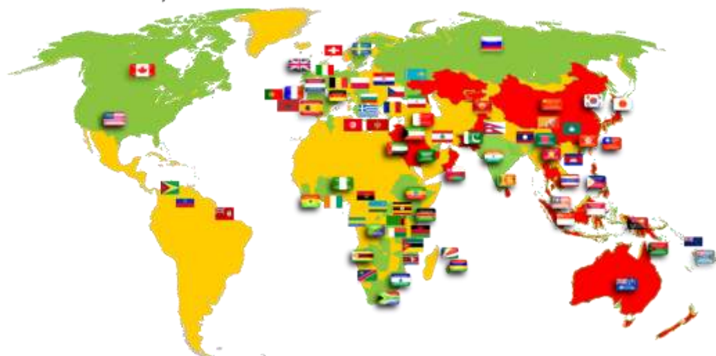
PLC Around the World ■ Mauritius-based ■ KL-based

Our PLC Participants, Alumni & Guest Speakers Over 8,000 PMs and 80 countries over 6 continents