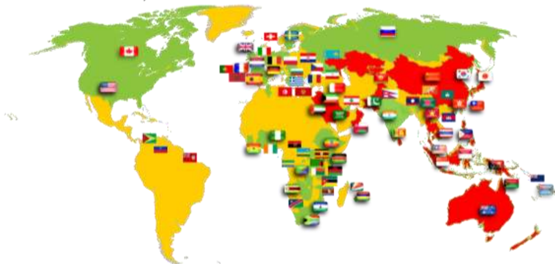
PLC Around the World ■ Mauritius-based ■ KL-based

Our PLC Participants, Alumni & Guest Speakers Over 8,000 PMs and 80 countries over 6 continents