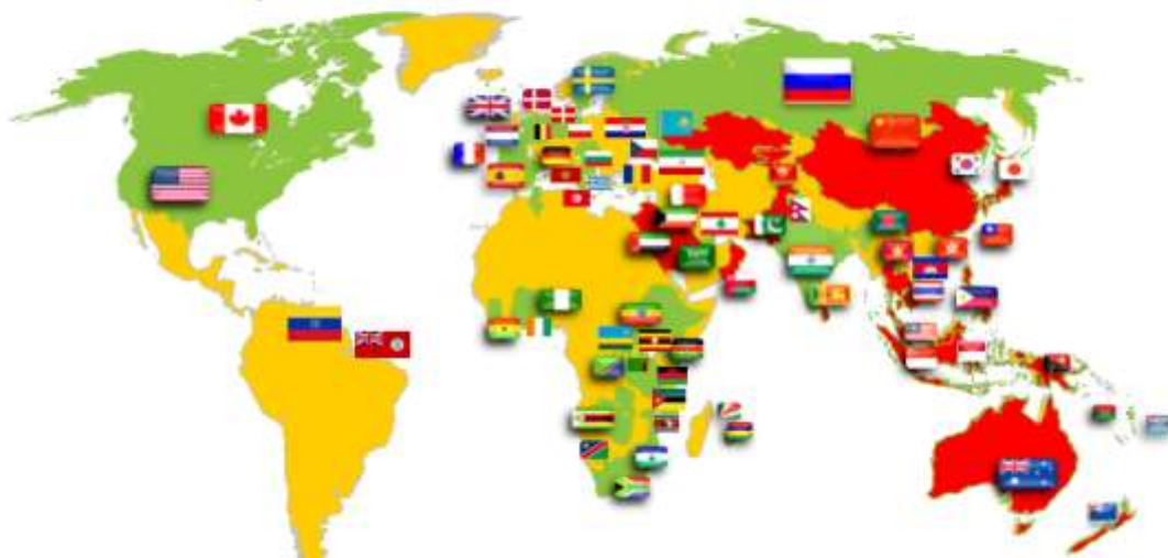
PLC Around the World ■ Mauritius-based ■ KL-based

Our PLC Participants, Alumni & Guest Speakers Over 7,000 PMs and 75 countries over 6 continents